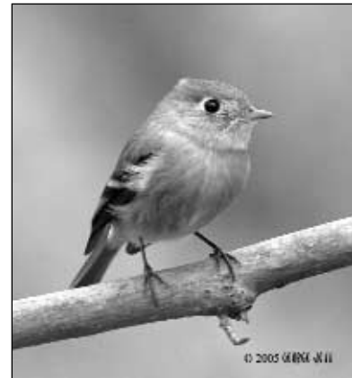
Photos of Gray Kingbird (top) and Hammond's Flycatcher (bottom) courtesy of George Jett.