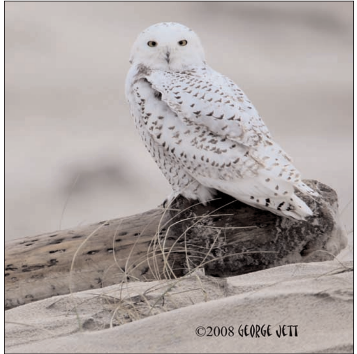
Snowy Owl seen on Assateague Island. Photograph taken on November 11, 2008 courtesy of George Jett.

distinguished from them because of its glossy sheen. Good photographs were taken and the bird was found again at the same site on Nov 17.