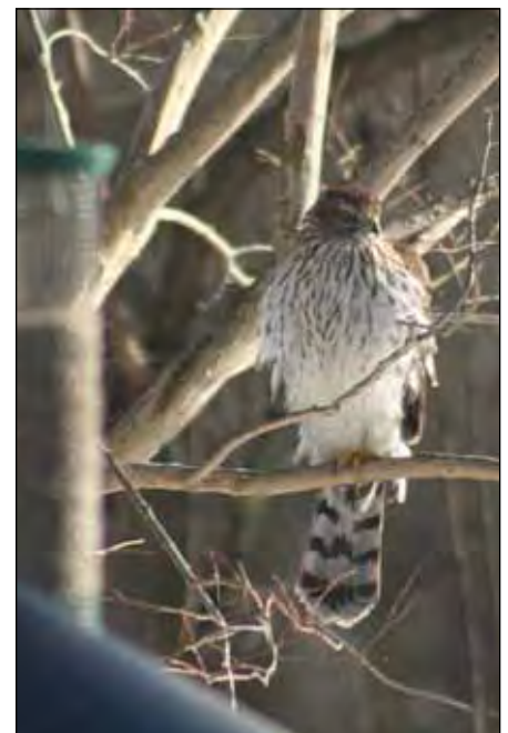
Also watching the feeder: a juvenile Cooper's Hawk.

of the most common feeder birds, a calendar, complete instructions, and Winter Bird Highlights , an annual summary of FeederWatch findings.