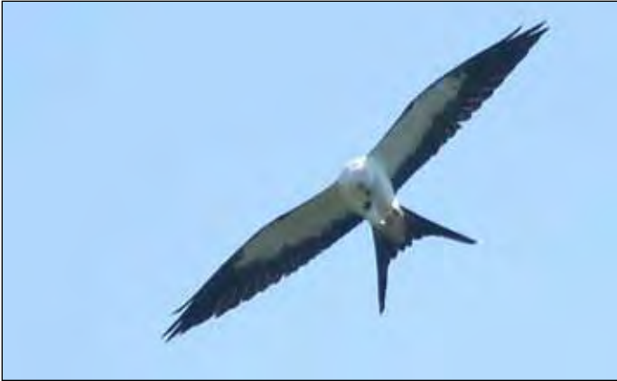
Dave Czaplak photographed this Swallow-tailed Kite at Hughes Hollow on September 4, 2009.