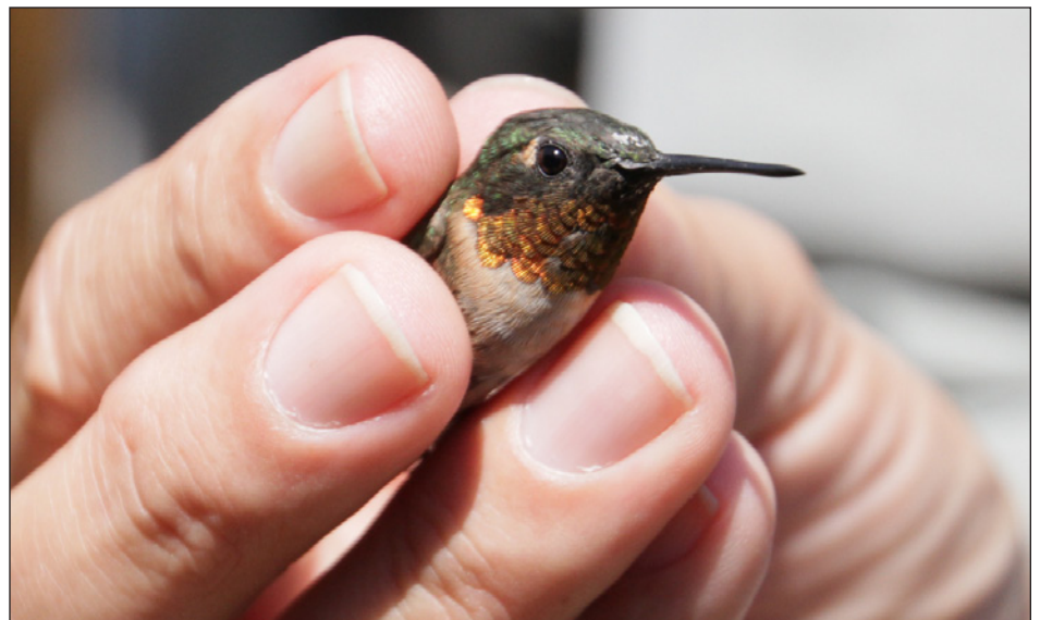
Banded and measured, this male Ruby-throat eyes his freedom.