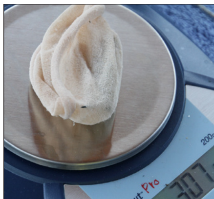
Bird in a sack weighs in.

Bruce quickly sets to work. Securing the bird in a little nylon “footie,” he uses a special pliers to fit it with a minuscule aluminum band; each band carries a unique number registered at Patuxent. He weighs the bird (approximately 3 grams) and measures wing, tail, and culmen. He checks it for signs of fat, an indication of readiness for migration.