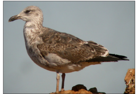
Can you ID this bird? No? Then maybe you want to sign up for the workshop.

Room reservations should be made directly with the Hampton Inn., which is located at Exit 109A off I-95 on Rte 279 in Elkton. Phone is 410-398-7777 or 1-800-Hampton; e-mail is ELKMD_hampton@hilton.com.